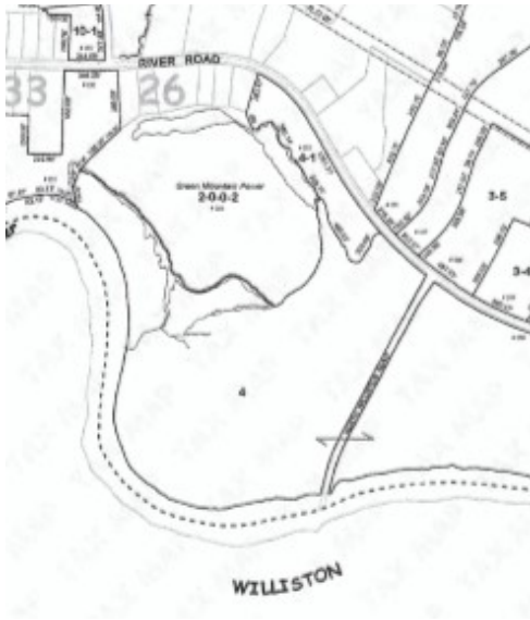
Essex tax map 2019. Fay Island upper left shown in Essex. Town line shown in middle of current Winooski River channel.

The maps shown in the Fall 2020 edition of the ECHS ECHO to illustrate the town line controversy were incorrectly presented with the Essex tax map shown twice. Reproduced here is the correct display of maps showing the town line between Essex and Williston as it is incorrectly drawn (dotted line) on the Essex tax map and correctly drawn (solid line) on the Williston tax map.